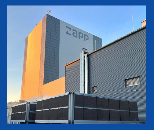
Zapp - Germany