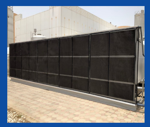
Coca Cola- UAE