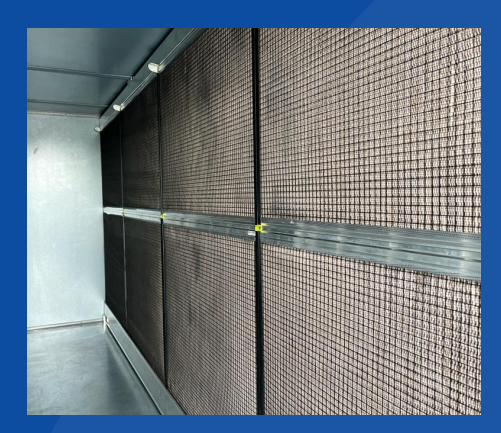
Filtration Group - Germany