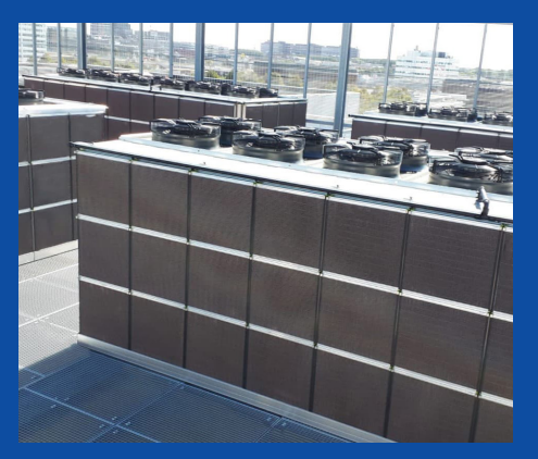
Equinix Datacenter - The Netherlands