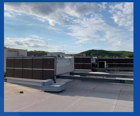
TESCO - Hungary