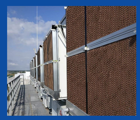
Logistic Union LLC - Ukraine