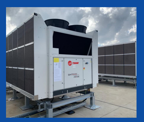
Equinix Datacenter - United Kingdom