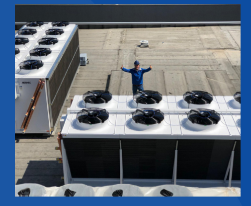
Steris - The Netherlands