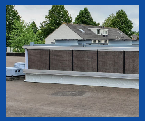
JUMBO - The Netherlands